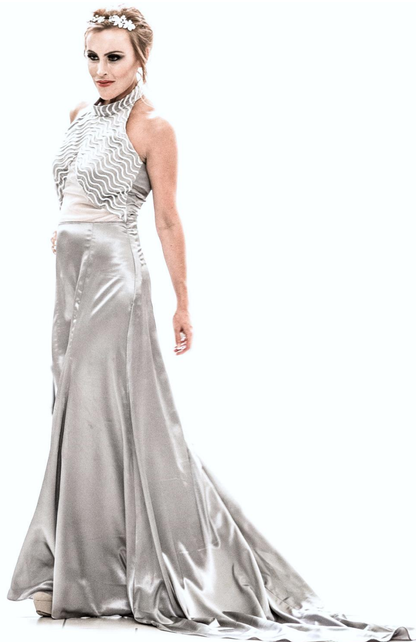
SILVER GIRGER CURVE GOWN