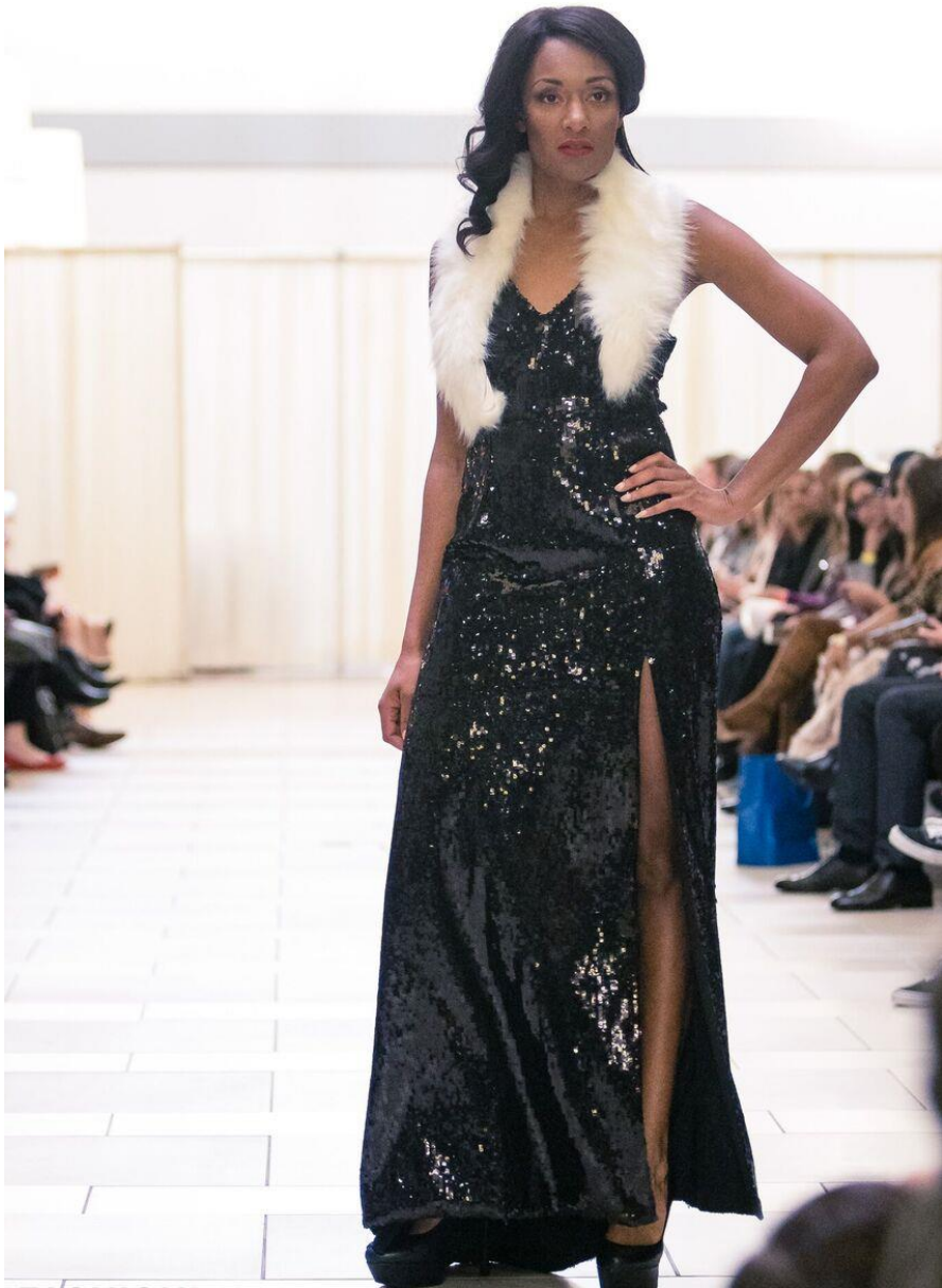
BLACK SEQUIN CARRIE DRESS