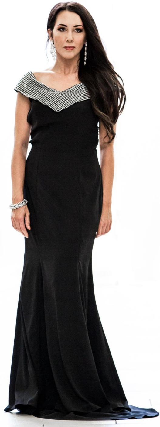
MAREN OFF SHOULDER GOWN