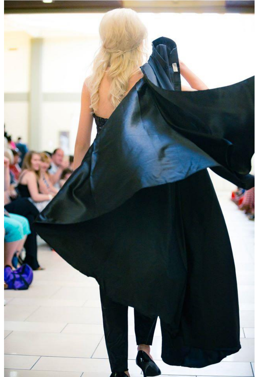
BLACK SEQUIN HOLLY JUMPSUIT WITH OVERSKIRT