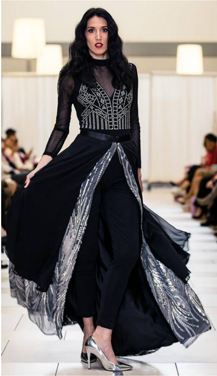
SEQUIN SERENA JUMPSUIT WITH OVERSKIRT