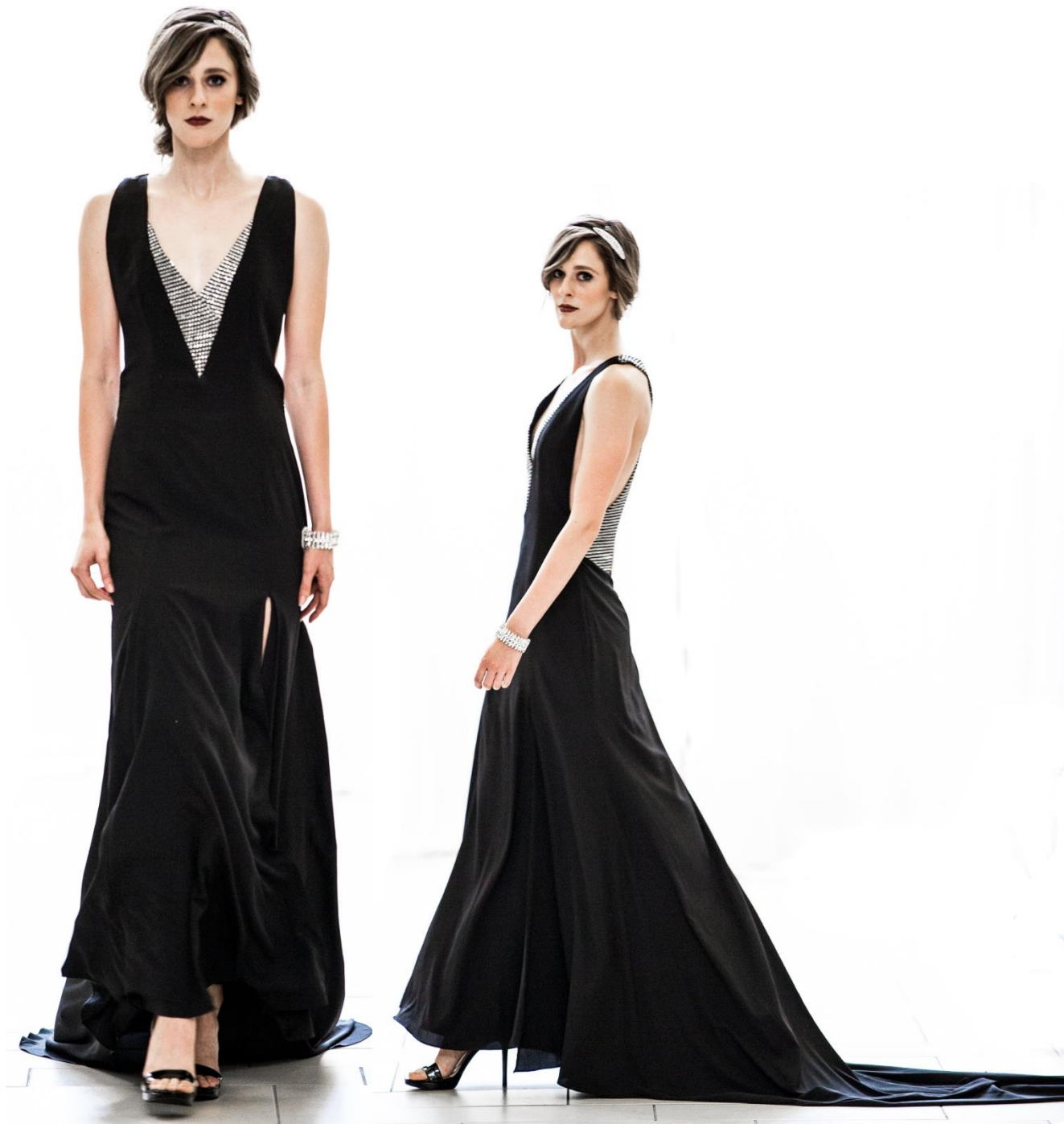
LAUREN STRIPE GOWN