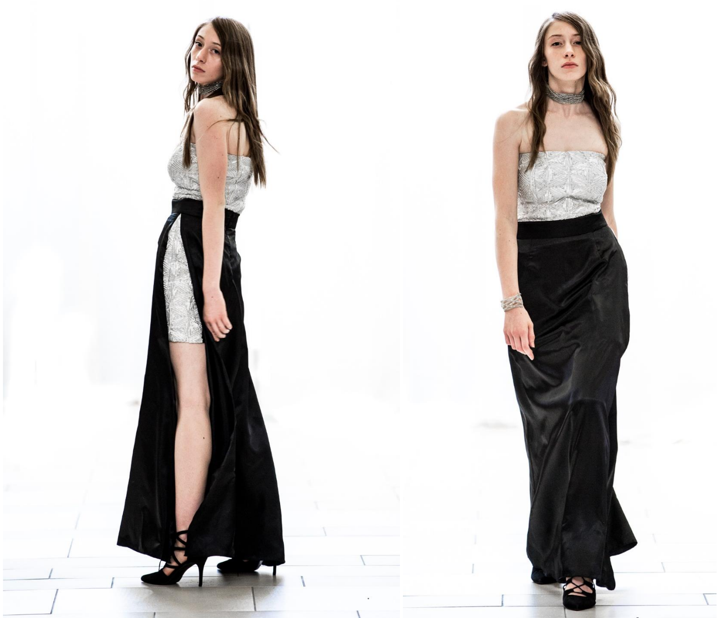
ASTRA TUBE TOP N SKIRT SET