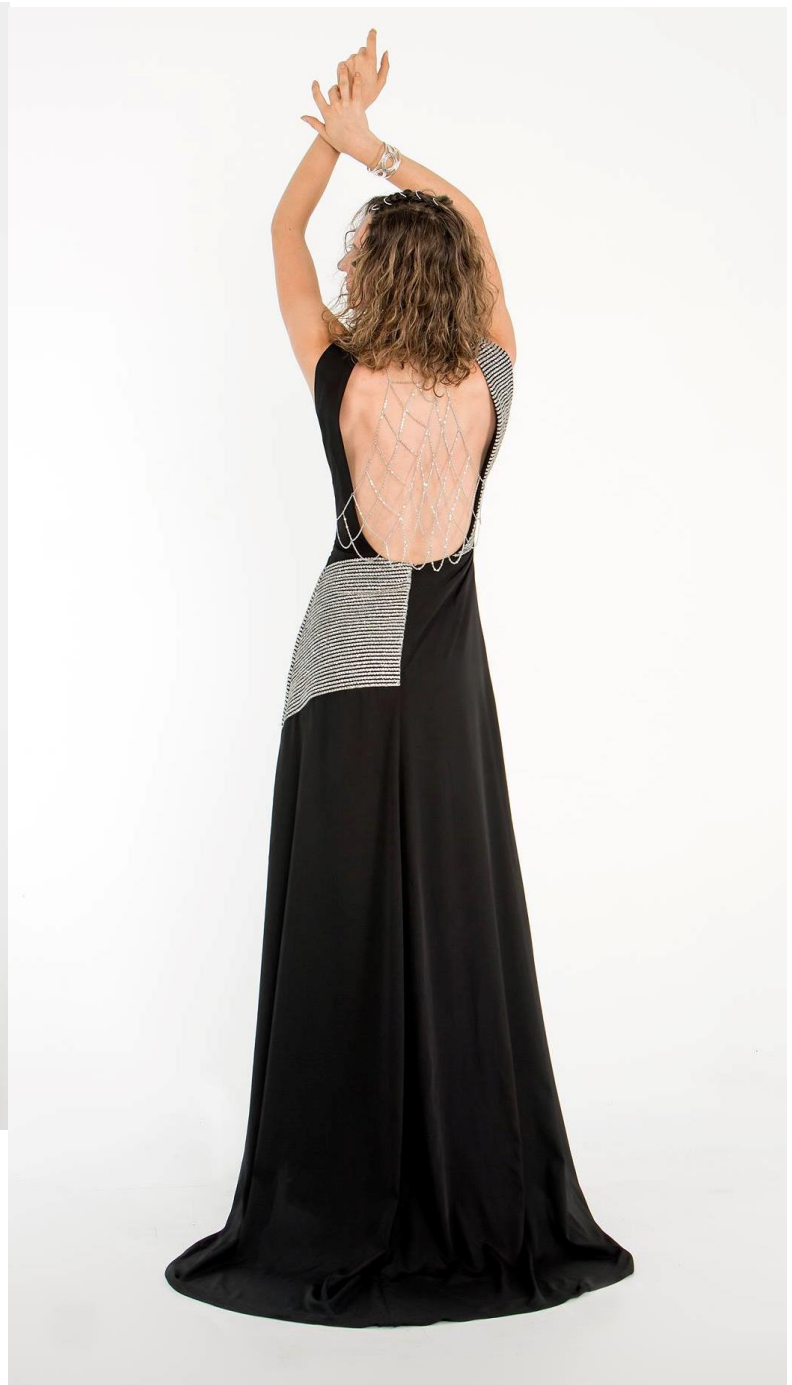
PAMELA PANEL GOWN