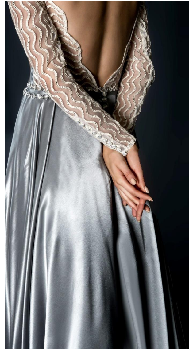
KAREN SILVER BALL GOWN