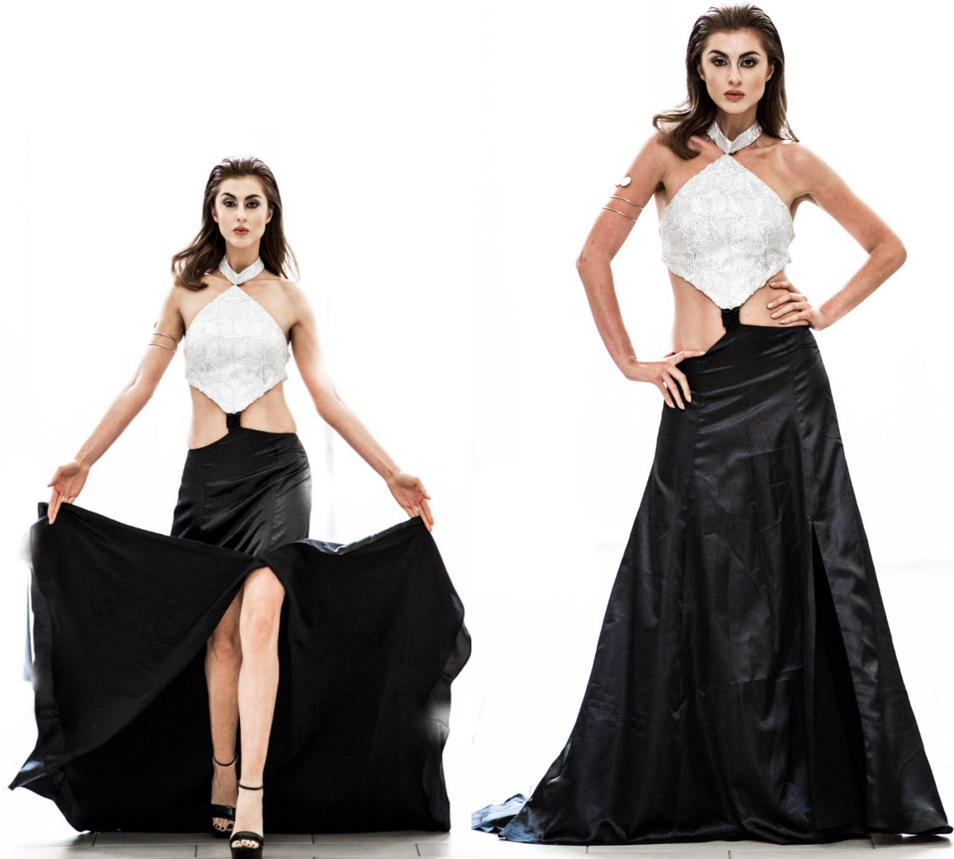
CLARE DIAMOND DRESS